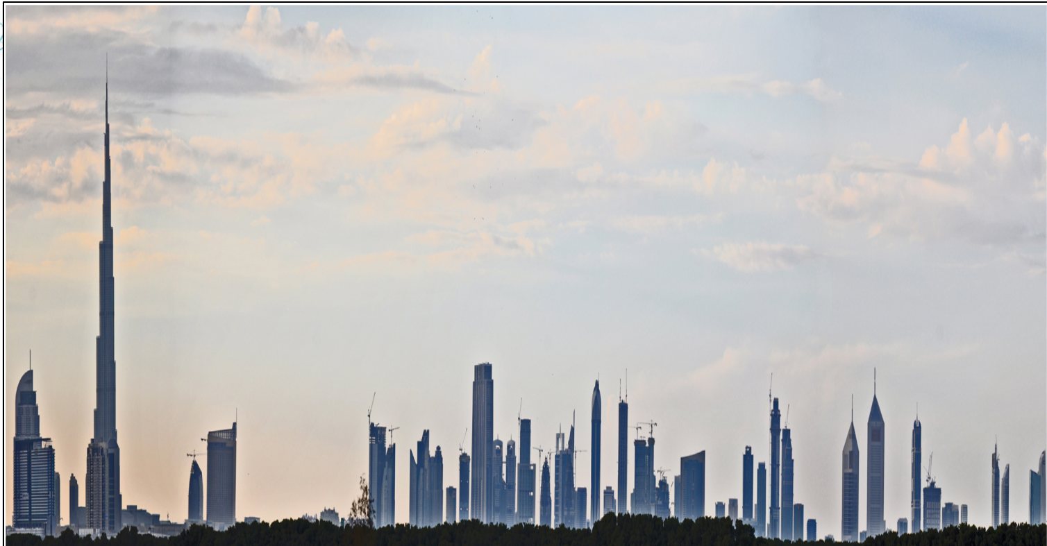
DUBAI SKYLINE 10/01/2010