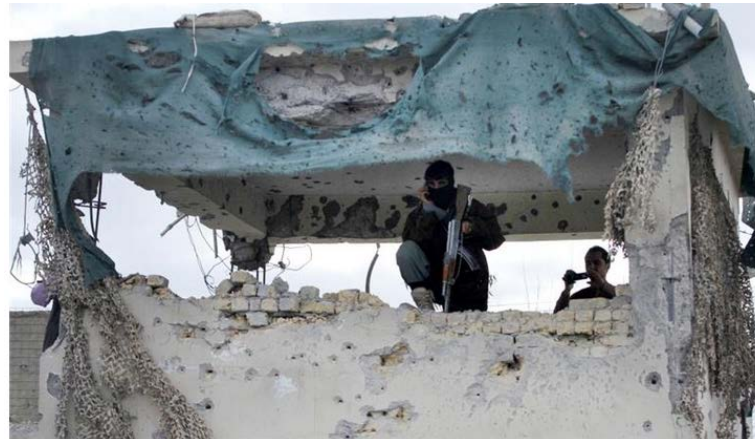
A security guard stands guard at police station after clashes between police and Taliban in Kandahar