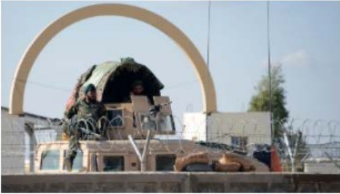
Afghan National Army soldiers keep watch after the airport attack.